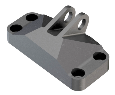
GE's original design The original design of the bracket used in the GE Aircraft challenge. The re-designed bracket was required to fit within this volume and meet load requirements while reducing the overall weight of the part.